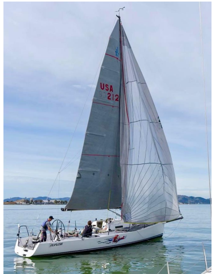
Drifter! Rufless was first to finish in the Fiasco.