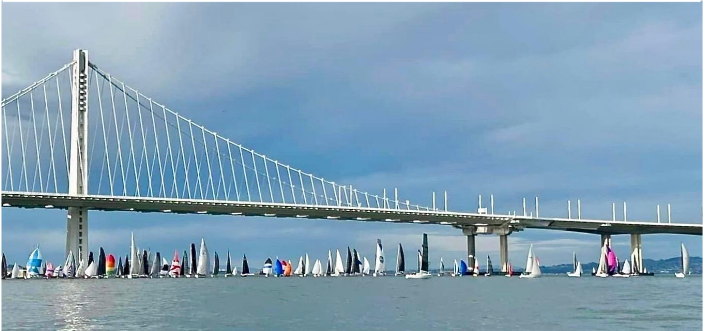
The Boulevard of Broken Dreams in the 2024 Three Bridge Fiasco.